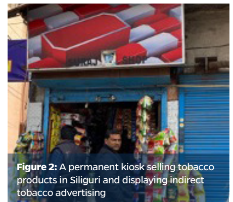
Figure 2: A permanent kiosk selling tobacco products in Siliguri and displaying indirect tobacco advertising