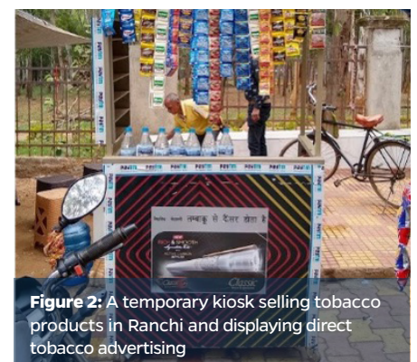
Figure 2: A temporary kiosk selling tobacco products in Ranchi and displaying direct tobacco advertising